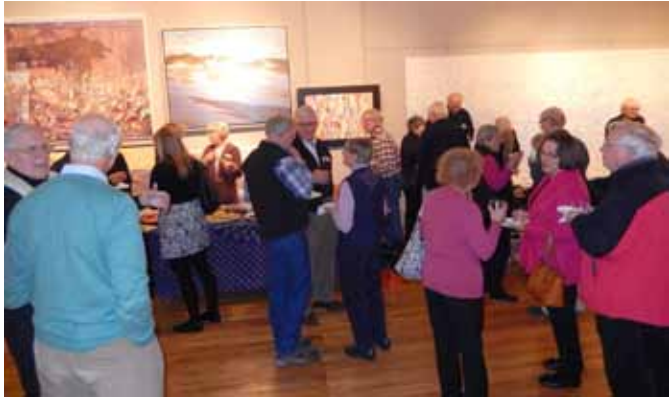
Our 2014 volunteer appreciation event

..... number of individuals who gave their time in 2014