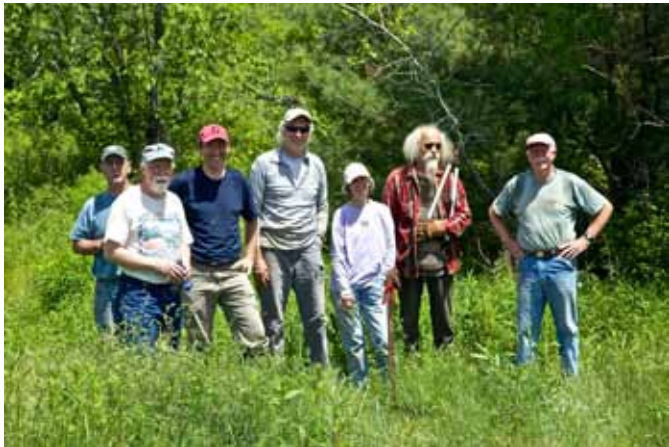
Members of the trails crew