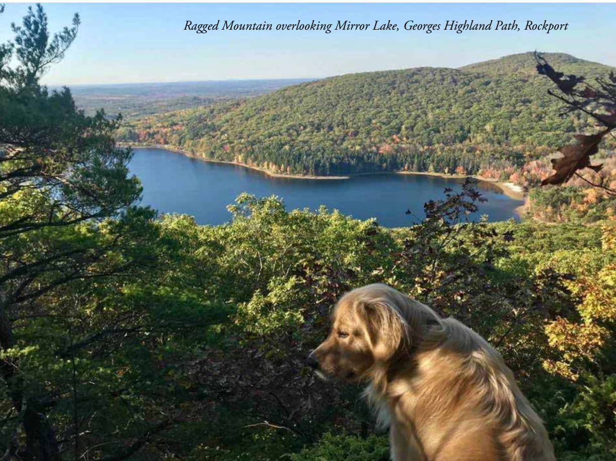
Ragged Mountain overlooking Mirror Lake, Georges Highland Path, Rockport

Every effort has been made to ensure the accuracy of these lists. If you see any errors or omissions, please contact us so that we may correct our records. Thank you!