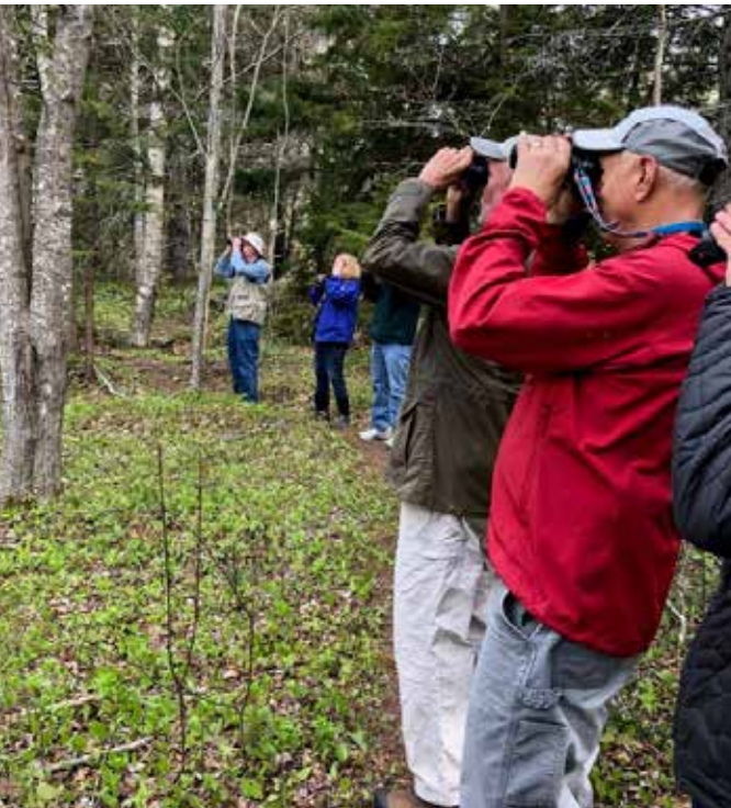
Out scouting for warblers in May.